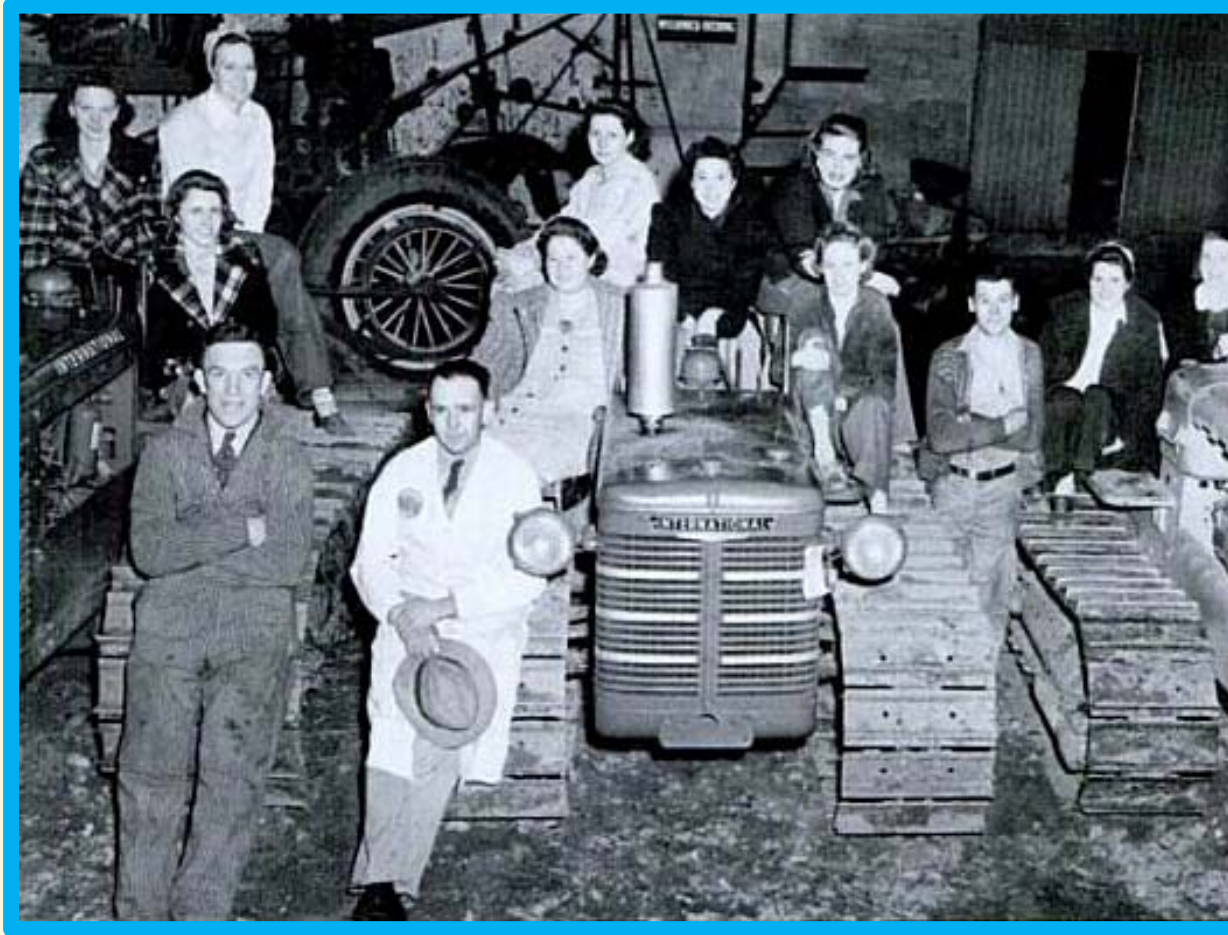
Tractorette School – WSU - 1942